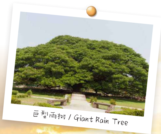
巨型雨树 / Giant Rain Tree