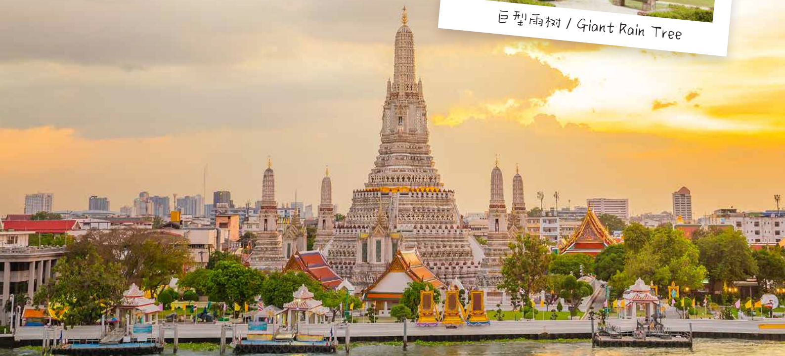
郑王庙 Wat Arun Temple